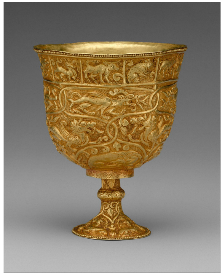
Stem Cup 7<sup>th</sup>-9<sup>th</sup> century